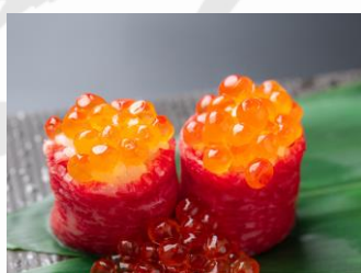
Overflowing salmon row sushi roll