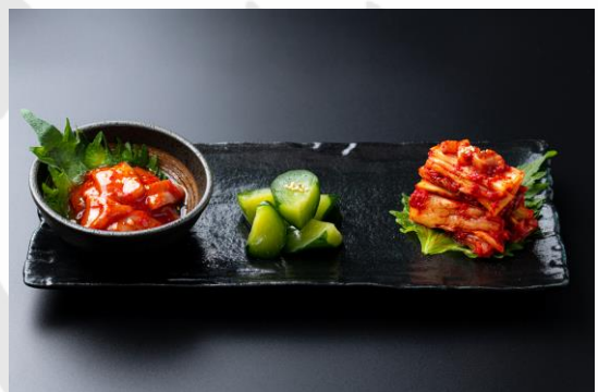
Assortment of 3Kimchi