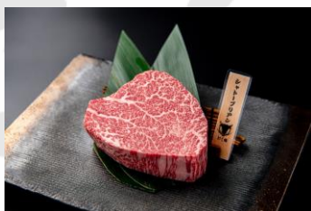
· Aged Ultimate Chateaubriand 【Limited】 (1 Piece 100g , order cut)