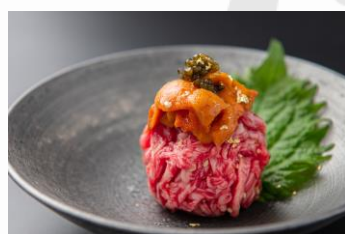
Raw Lean Beef sashimi tartar topped with Sea urchin

· Thick Cut Beef Tongue Back 【Limited】 ¥6000