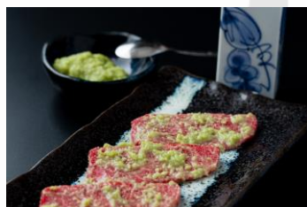
Lean Beef grilled with Wsabi

· Shimacho(large Intestine) salted or Marinated ¥1380